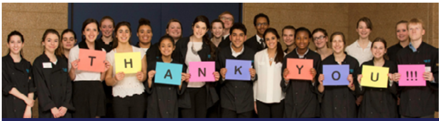
The students of Lake Park High School thank you for your continued support of the Foundation