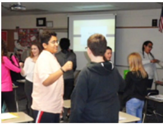
Using Fitbit activity trackers, purchased through a Foundation grant, a cross-departmental team of teachers was able to improve the overall performance of students in their classes.